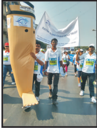
Mumbai Marathon: Rocking Debut