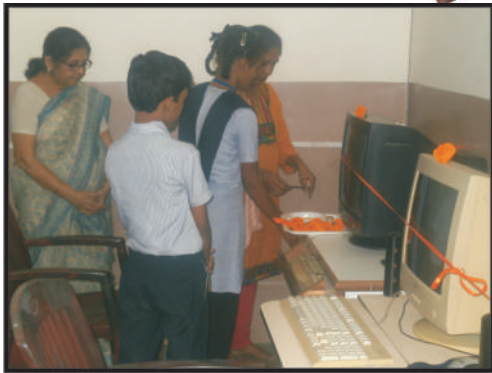
Inauguration of Computer Education classes