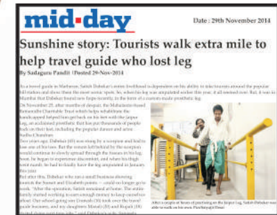
Ratna Nidhi's Jaipur Foot Center in newspapers